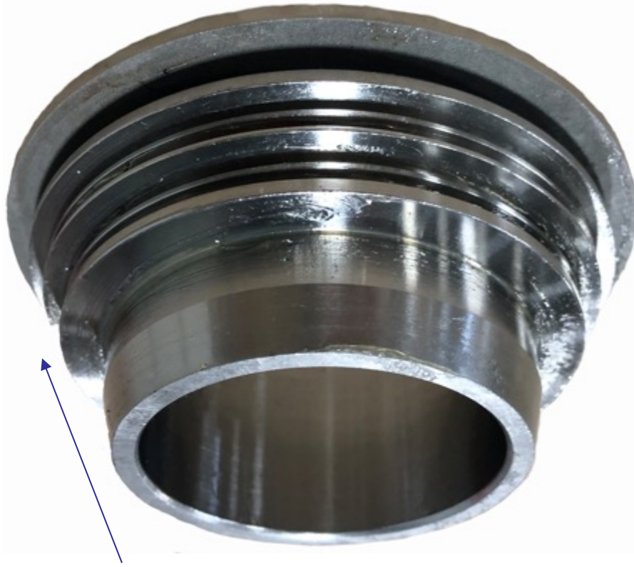
Series of Labyrinth to prevent the ingress of contaminants

Frequent greasing is both time-consuming and expensive when you consider 95% leaks into the environment . This leads to financial, environmental and even safety issues.