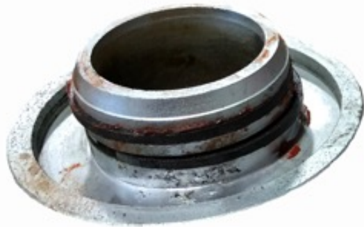
Current Standard OEM Style LBS